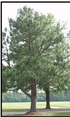
Longleaf Pine (tree)