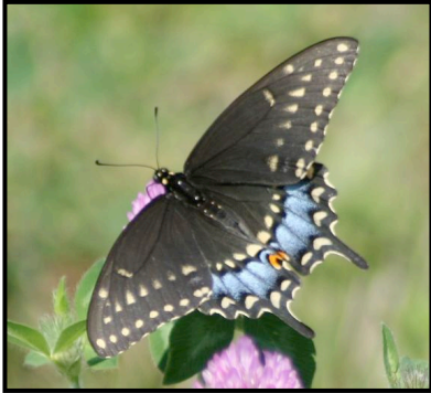
Eastern Black Swallowtail