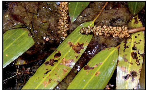
Longleaf Pondweed (aquatic plant)