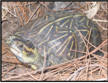
Florida Box Turtle

Diet: Grasses, leaves, fruits, invertebrates, small vertebrates