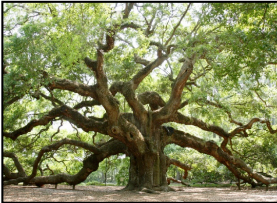
Live Oak (tree)