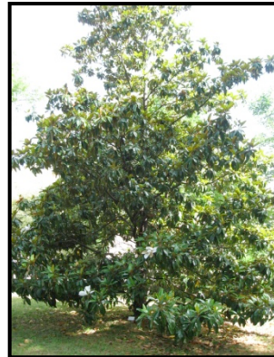
Southern Magnolia (tree)