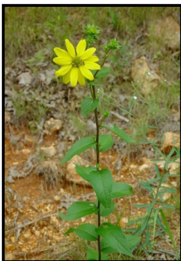
Starry Rosinwood (wildflower)