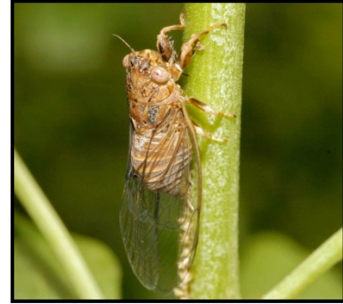
Little Brown Cicada

Diet: Grasses, leaves, fruits, invertebrates, small vertebrates