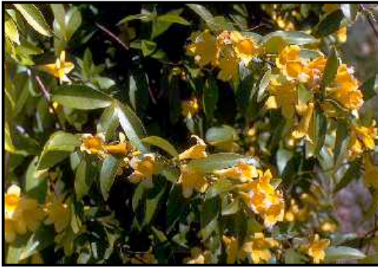
Carolina Jasmine (vine)